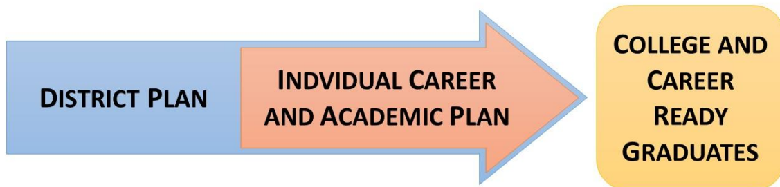
Figure 1: District and Individual Plans: The District Career Guidance Plan supports students in 8 th through 12 th grade as they develop, revise, and use their Individual Career and Academic Plan (ICAP) to guide them through high school and beyond.